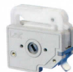
DG-1, DG-2, DG-4